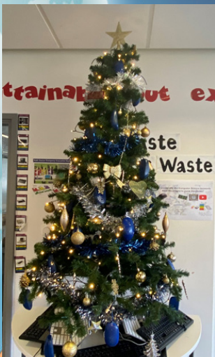
Computing, ICT & Business

Our Christmas Trees are Going Up! School is starting to look very festive with some great trees on display. Here's some lovely examples: