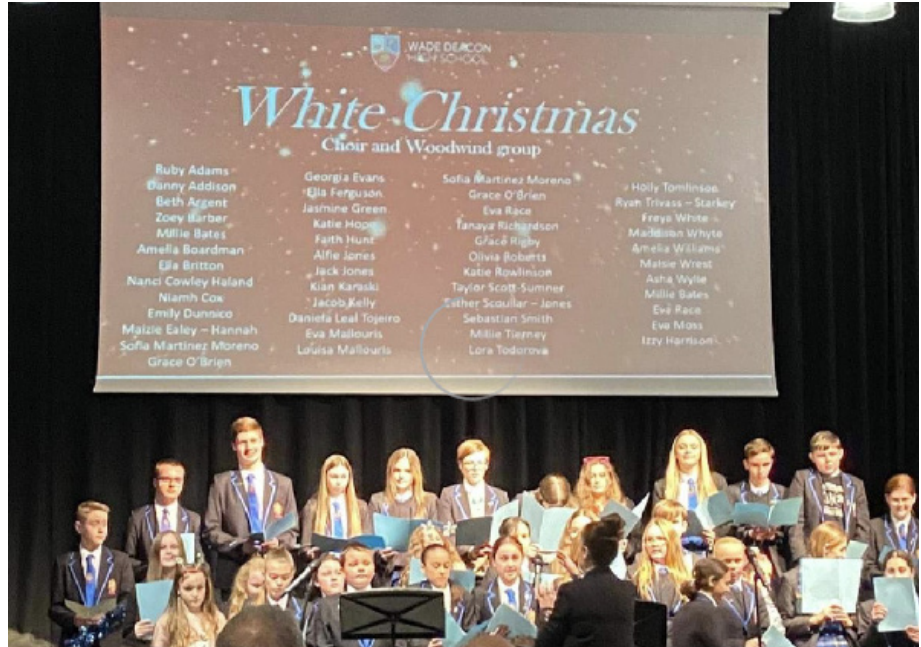
"It really was a fantastic show! The talent is truly a credit to you for your hard work and dedication."

It was an emotional evening, with many of our singers and actors making their live debut alongside our experienced performers to take their moment in the spotlight and truly show us what they are capable of!