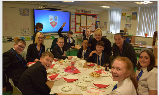
Students in our Life Skillz Club celebrated the contribution made by service personnel and the modern British values they protect through a special Cream Tea after school. A big thank you to all involved!